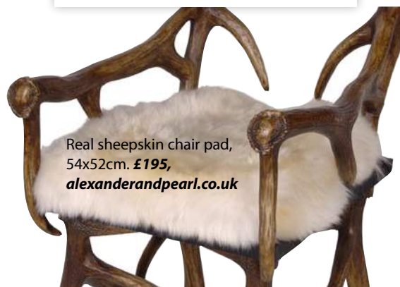
Real sheepskin chair pad, 54x52cm. £195, alexanderandpearl.co.uk