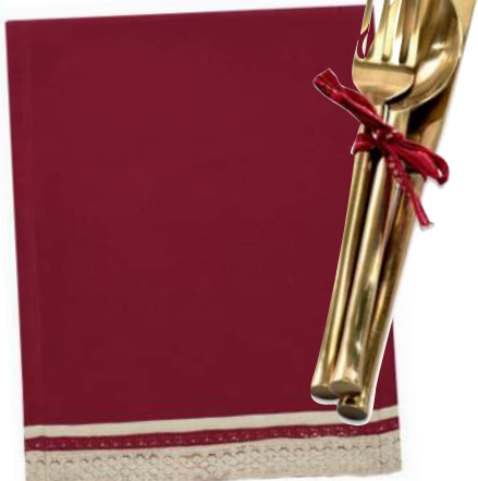
'The Parisian' three-piece cutlery set in antique gold finish. £16.95, nkuku.com Claret and cream table runner, 180x40cm. 100% cotton. £14.50, lamaisonbleue.co.uk