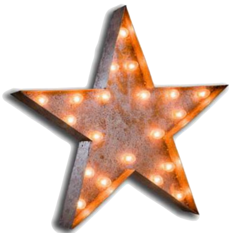
Vintage steel lightbulb wall feature, finished in distressed rust effect. £300, alexanderandpearl.co.uk