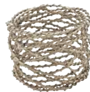
Twig-style metal napkin ring in silver effect. £3.50, lamaisonbleue.co.uk