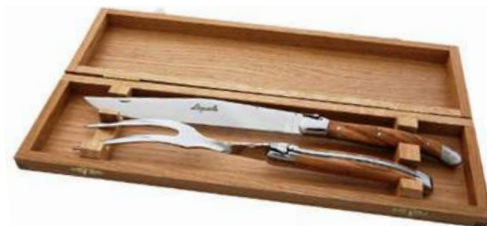
Laguiole olive wood carving set in varnished oak box. Hand wash only. €134.80, couteau-laguiole.com