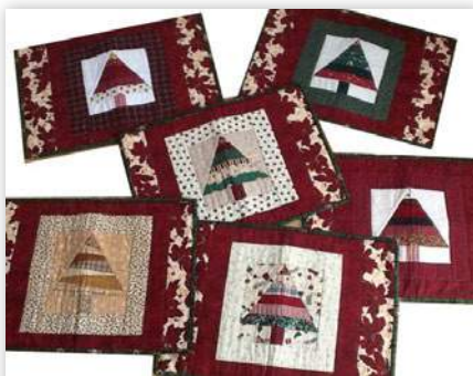
Set of six embroidered Christmas tree placemats, 100% cotton. £36, villeecampagne.co.uk