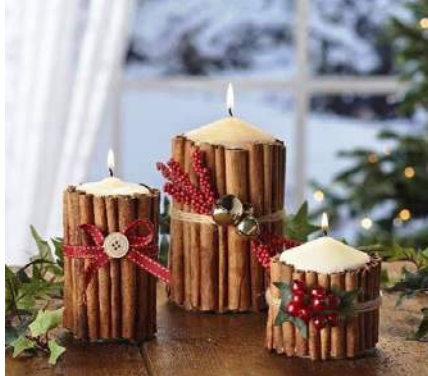
Set of three cinnamon stick candles with Christmas ribbon ties. £18, dibor.co.uk