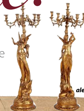
Pair of gold nymph candelabra, 107cm tall and each with seven holders. £495, alexanderandpearl.co.uk