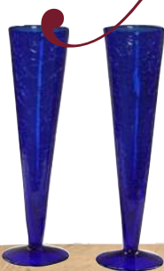
Pair of champagne flutes in blue blown glass with crackle glaze. €60, comptoirazur.com

Do as the French do this Christmas and dine long, late and with plenty of sparkle