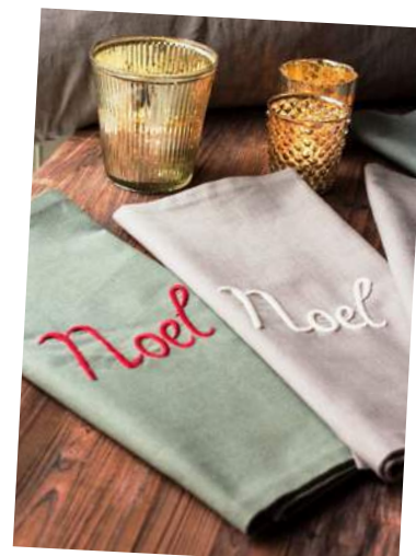
Set of six hand-embroidered Noël napkins, 100% cotton. £21, villeecampagne.co.uk

Pinterest Follow our interiors board: Pinterest.com/frenchpropnews/interiors