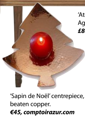
'Sapin de Noël' centrepiece, beaten copper. €45, comptoirazur.com